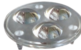
3 B 3570 D