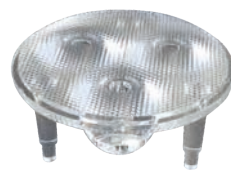
3 B 60 D