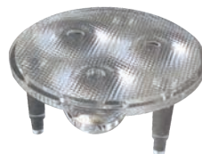
3 B 45 D