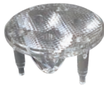
3 B 25 D