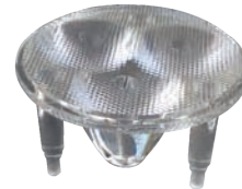
3 B 50 D